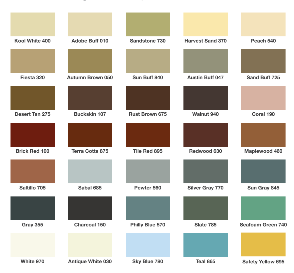
NOTE: This printed color chart is for reference purposes only. Euclid Chemical recommends choosing colors from actual test samples.

From 35 standard colors, hundreds of combinations are available to color the base coat and top coat. The printed color chart is for reference purposes only. Euclid Chemical recommends chosing colors from actual test samples.